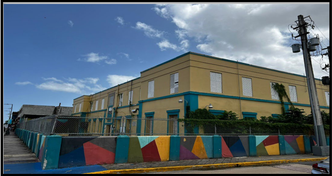
View of the southwest side of the Property