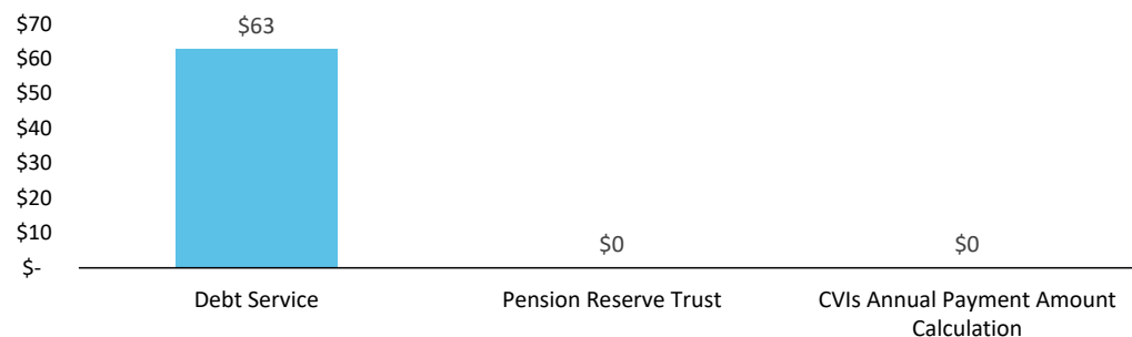
Plan-Related TSA Disbursements ($M)