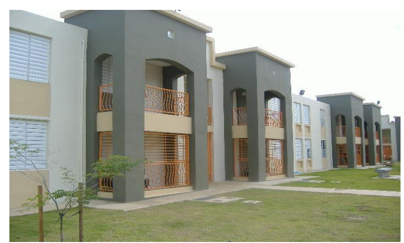
Lagos de Blasina