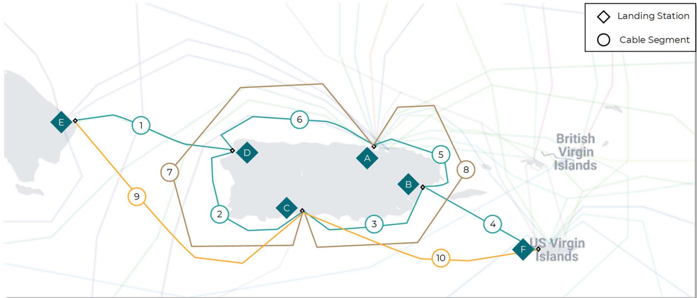
Figure 3. Potential cable "ring" route segments and landing stations