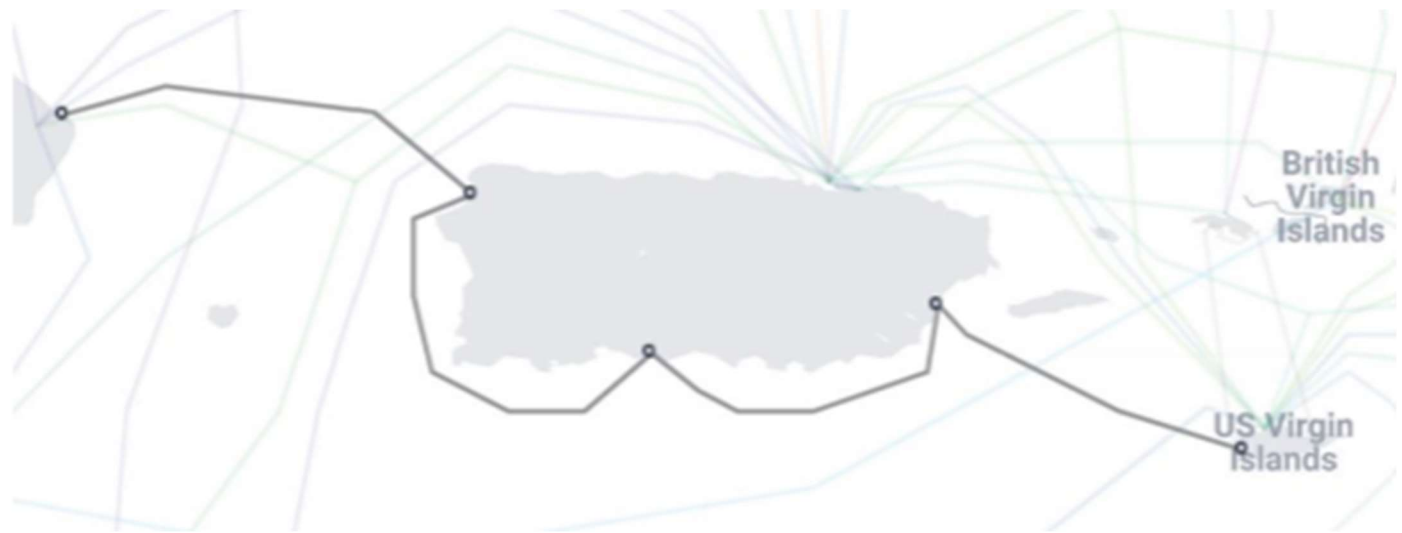
Figure 2. Early cable "ring" route and landing point concept

Relatedly, a key requirement of the Desktop Study is to evaluate and assess the viability of potential segments for submarine cable routes. The analysis will involve examining environmental, geological, and technical considerations to determine the feasibility of various segments and identify any potential risks or challenges. Additionally, the Desktop Study must include rough order of magnitude (ROM) cost estimates for each route, offering a high-level financial outlook that can help inform decision-making and support the planning process. This evaluation is crucial for optimizing route selection, managing project risks, and ensuring cost-effective implementation. The selected Applicant will, at a minimum, evaluate the potential route segments and landing station locations noted in Figure 3 . The Desktop Study should also consider and recommend other solutions that better improve overall system resiliency, if identified.