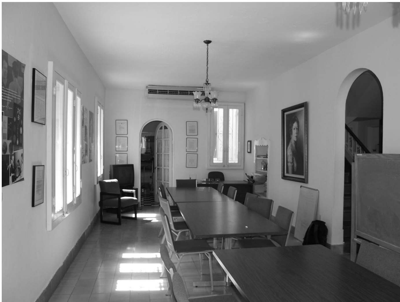
Figure 4. Former living room / dining room.