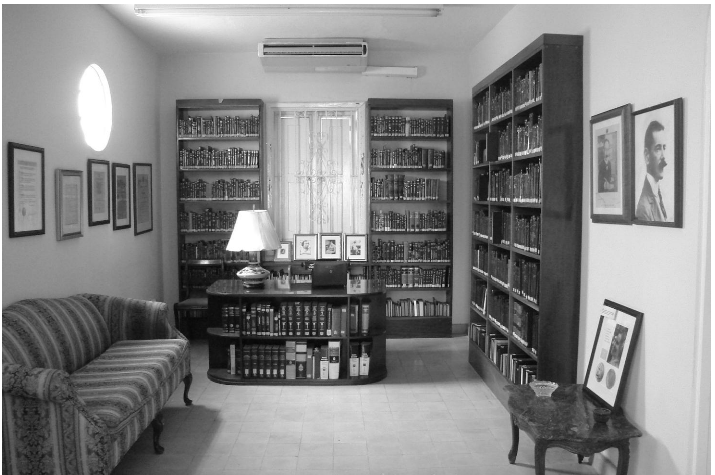
Figure 5. Concha Meléndez's workplace, 2011.