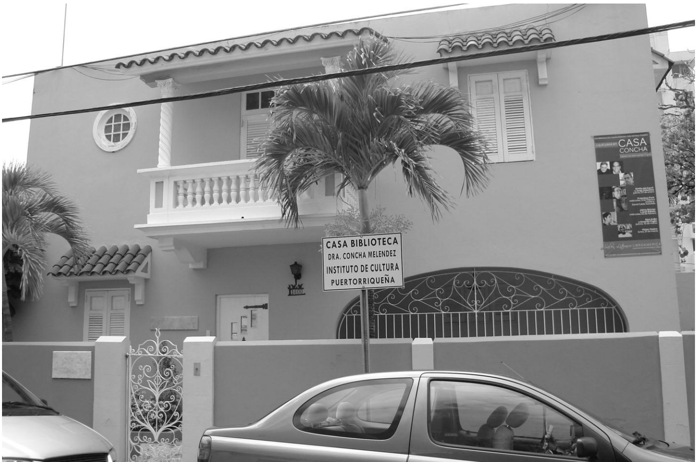
Figure 1 Casa Dra. Concha Meléndez Ramírez