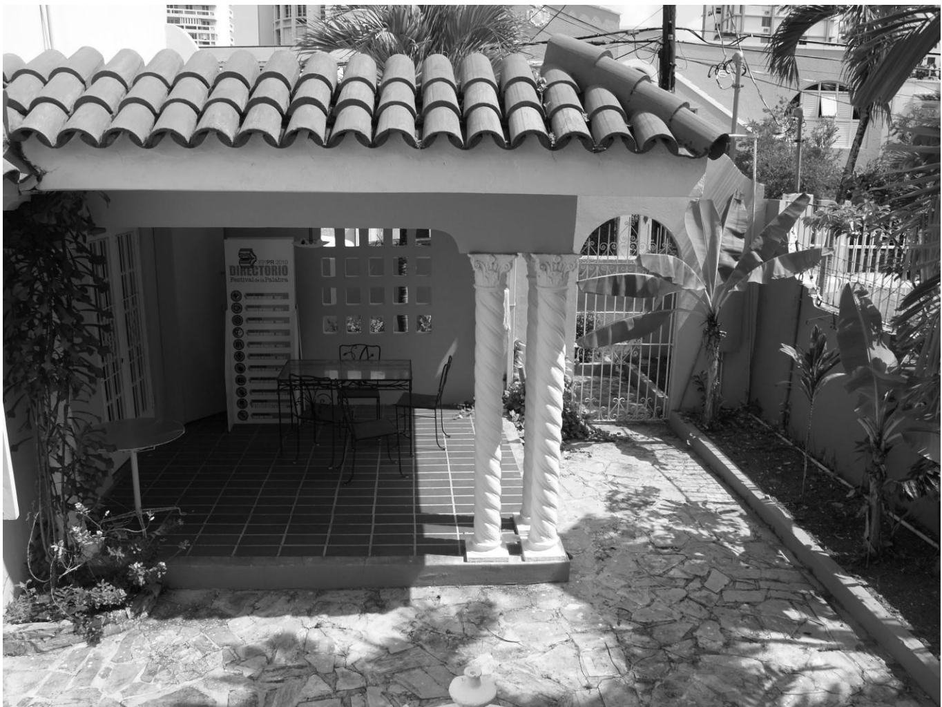
Figure 2. Terrace