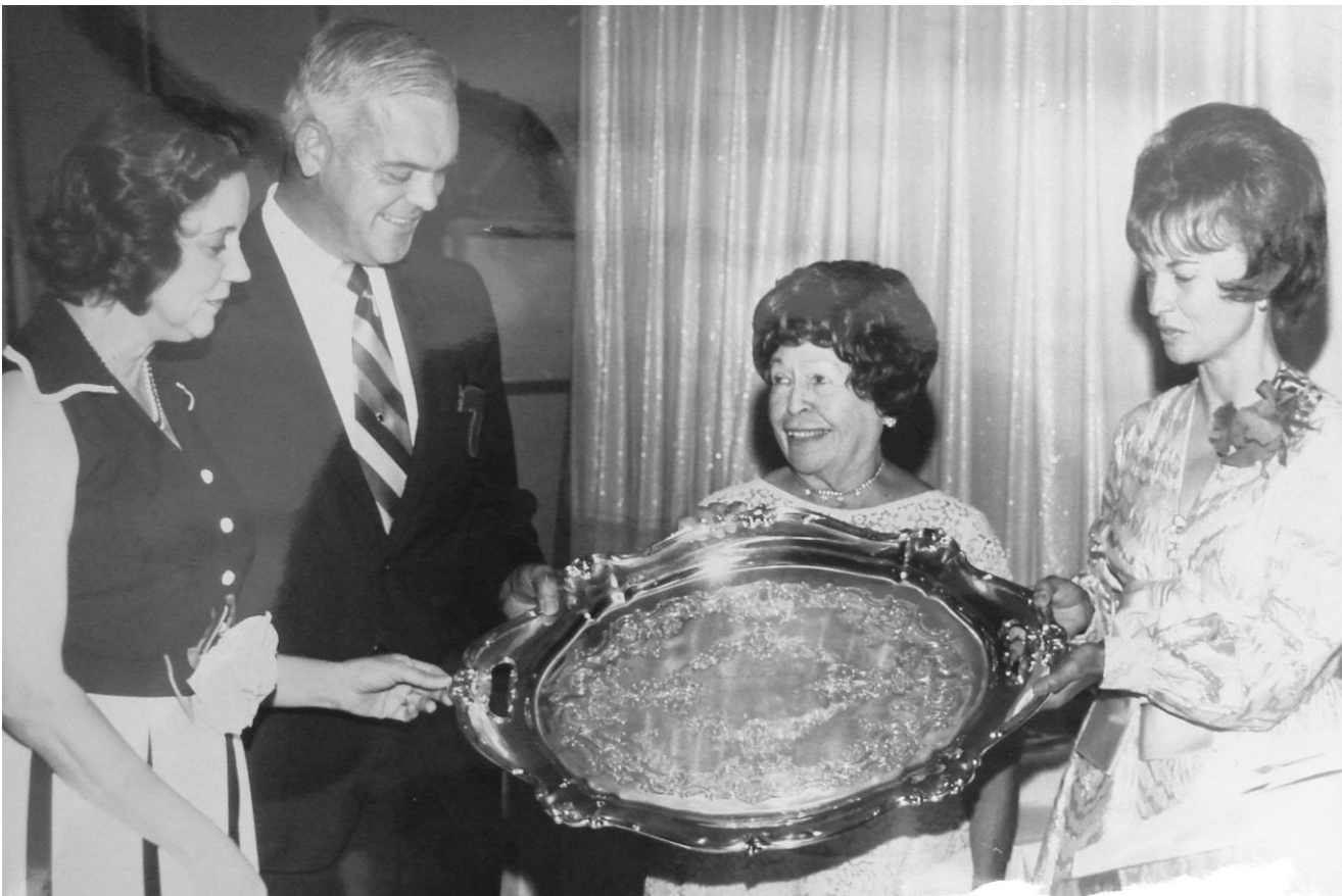
Figure 8. Concha Meléndez receiving the Women of the Year Award, 1971.