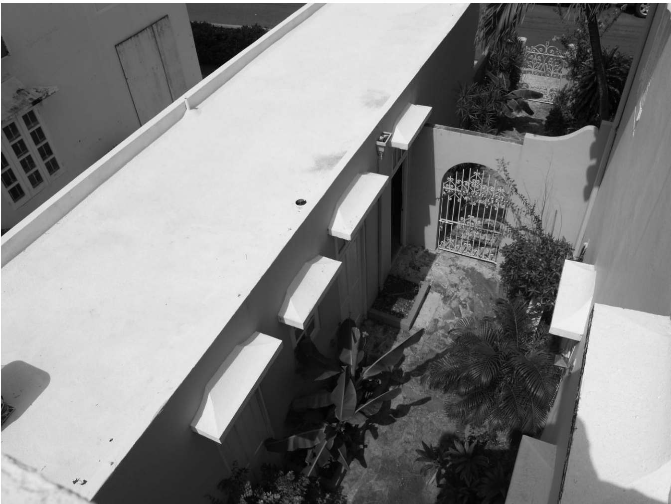
Figure 3. Garage / House service building.