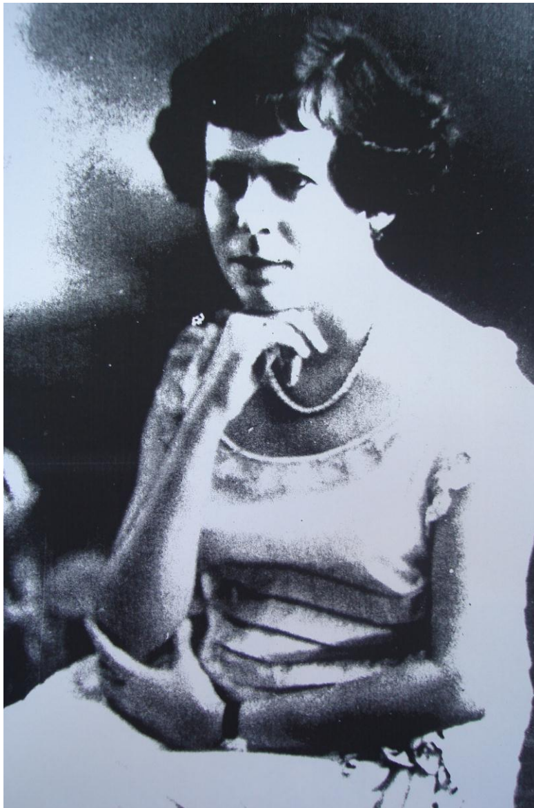
Figure 6. Dra. Concha Meléndez Ramírez