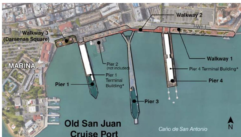
Figure 2: Piers & Walkways

These piers comprise two structures, a relieving platform structure and a cantilevered bulkhead structure to the east of the piers. The MARAD survey report concludes that both structures are in a poor condition and require extensive repairs.