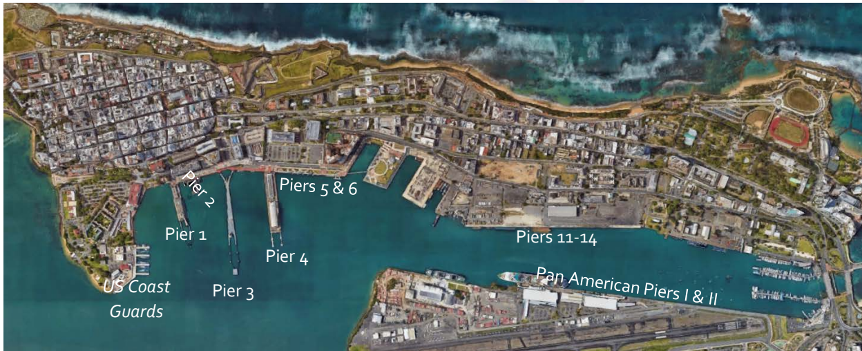
Figure 1: San Juan Cruise Ship Piers

Respondents should note that the PRPA is considering a second phase for the Project which would include additional piers. The conditions and responsibilities for this second phase, if determined to be included, will be elaborated in the RFP. For purposes of responding to this RFQ, Respondents should assume the development of the Piers as described in this RFQ.