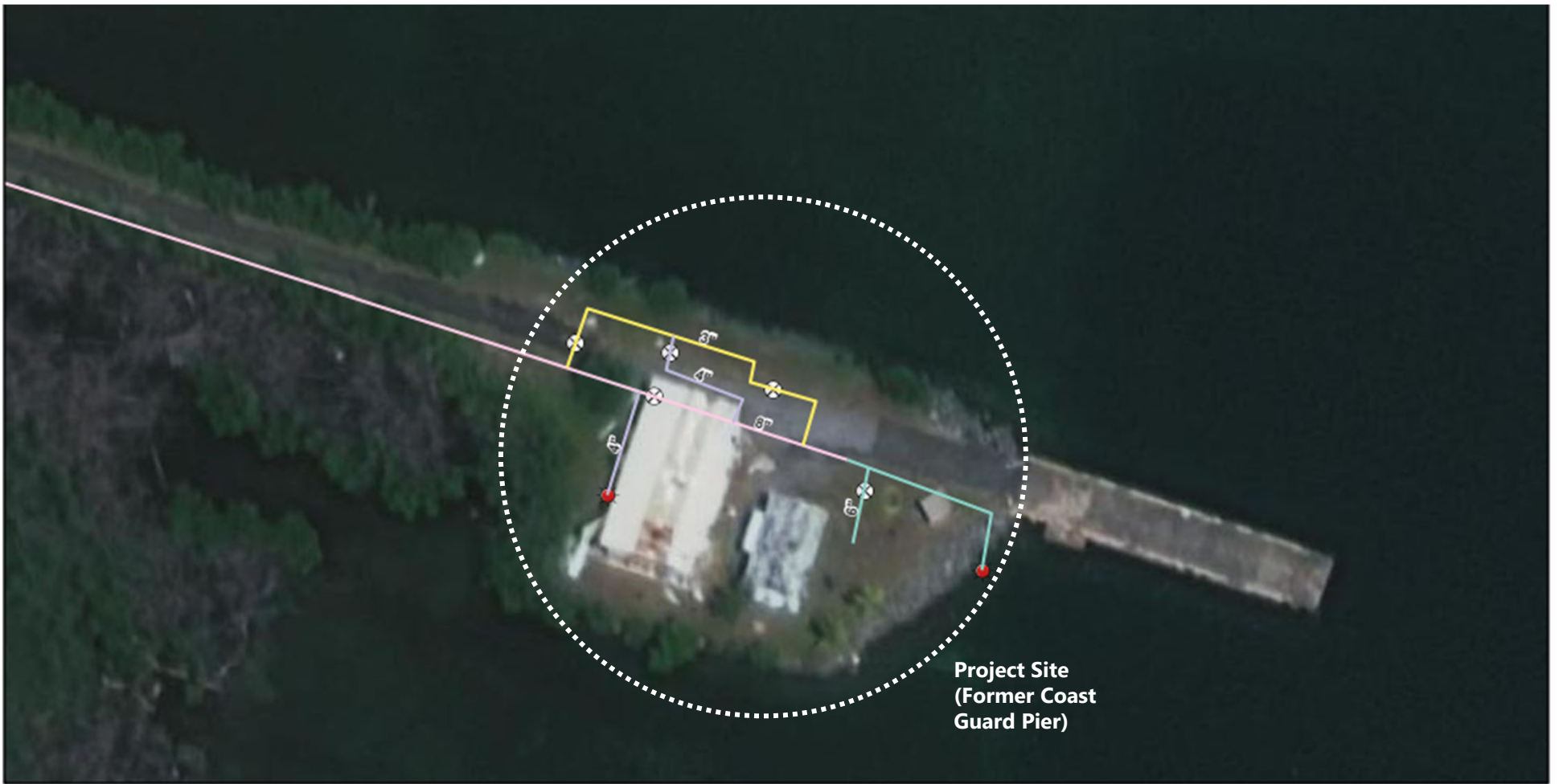
Project Site (Former Coast Guard Pier)