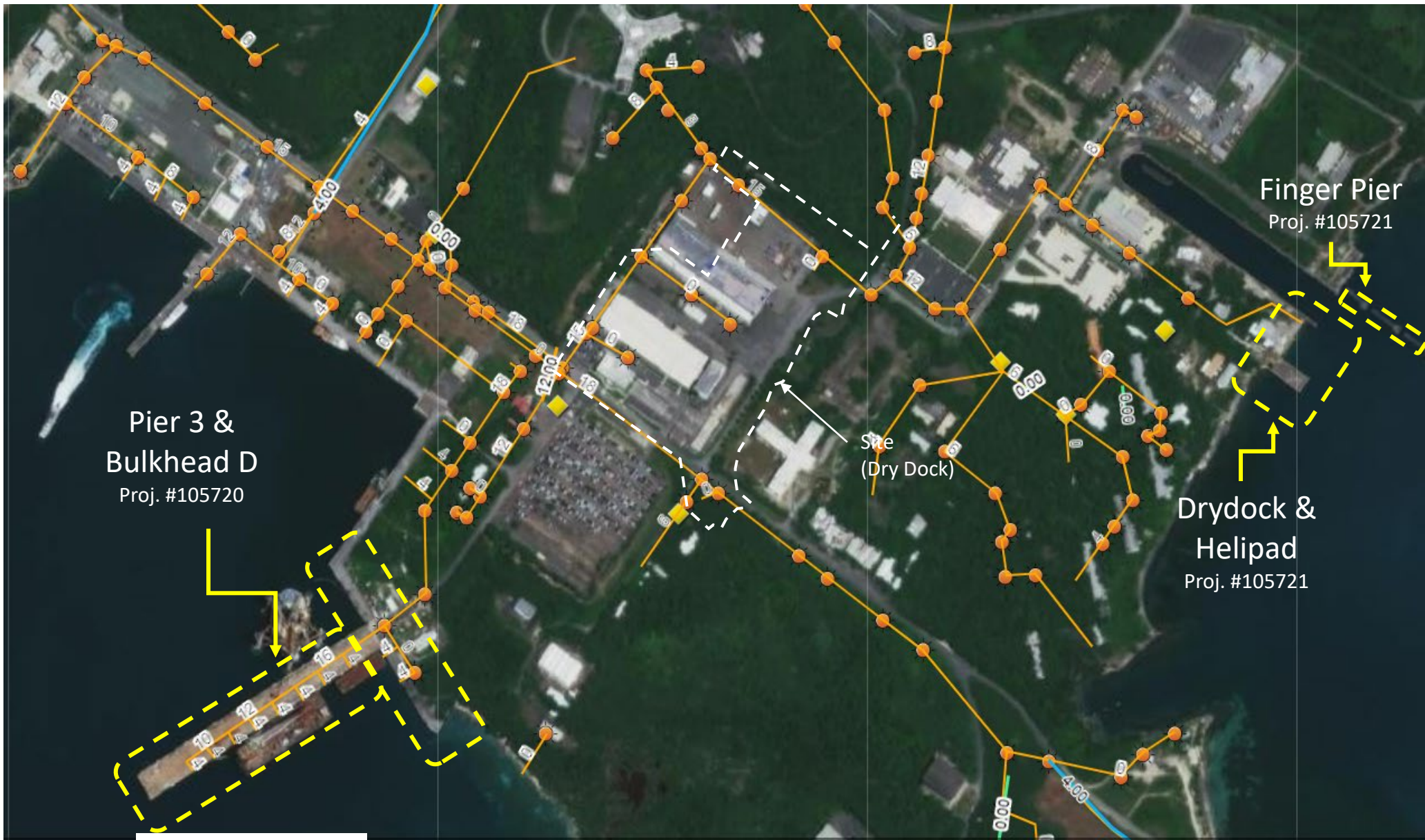
Exhibit H-2 Infrastructure Sanitary Water Roosevelt Roads