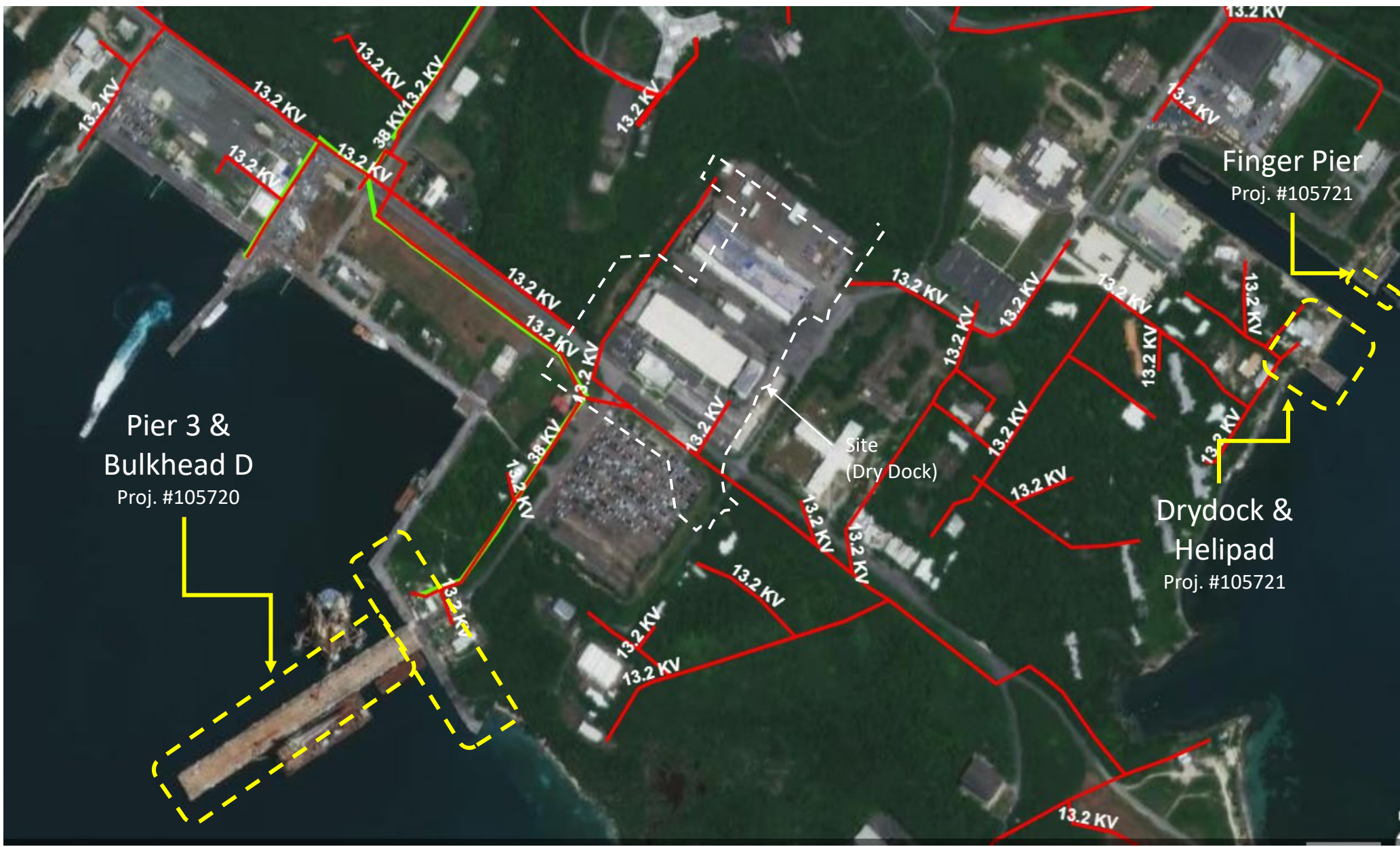
Exhibit H-3 Infrastructure Power Lines