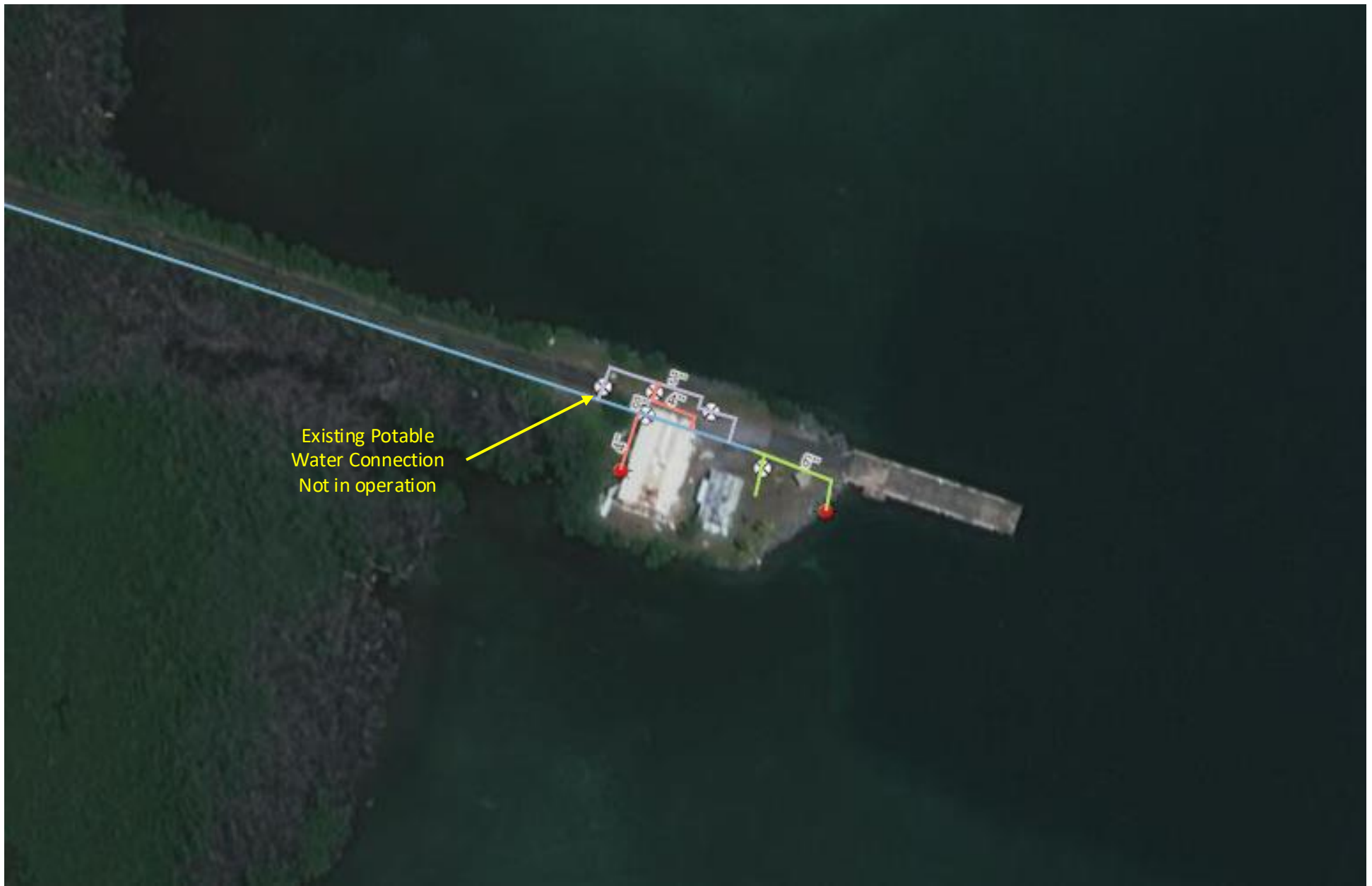
Exhibit #I-1 Infrastructure Potable Water-Coast Guard Pier Facility Roosevelt Roads