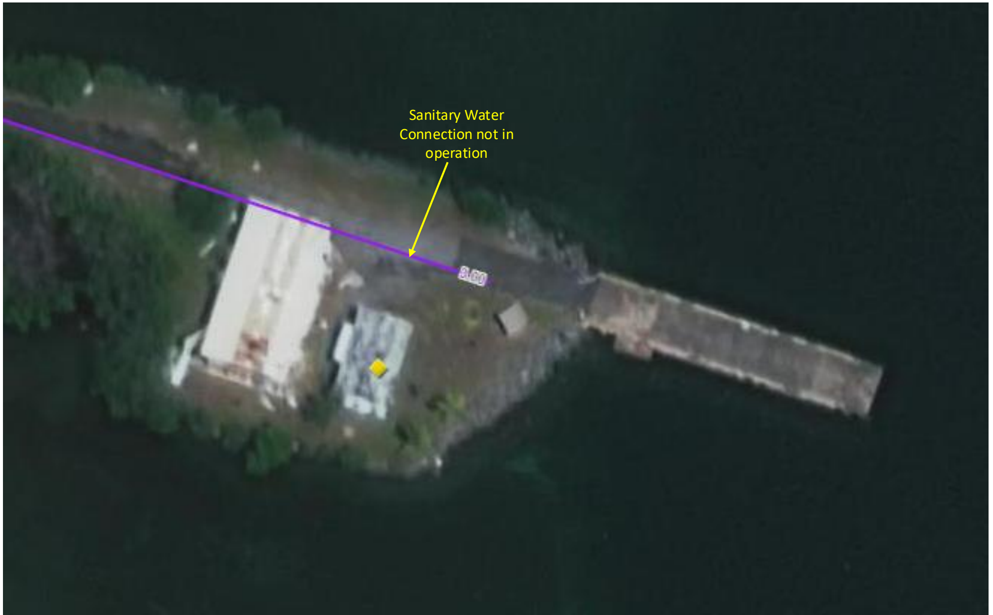
Exhibit #1-2 Infrastructure Sanitary Wastewater – Coast Guard Pier Roosevelt Roads